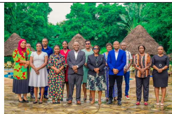
Inception meeting of EASTC-IAC