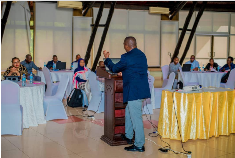
Training on Environmental and Social safeguard to IPIU and GRIC members