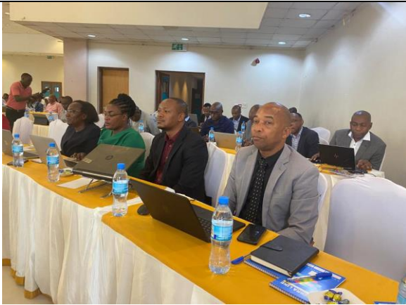
EASTC participated in the World Bank Mid-Term Review