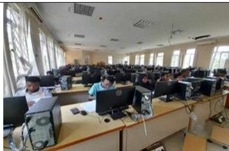
Computer lab supported by HEET project(now is functional )