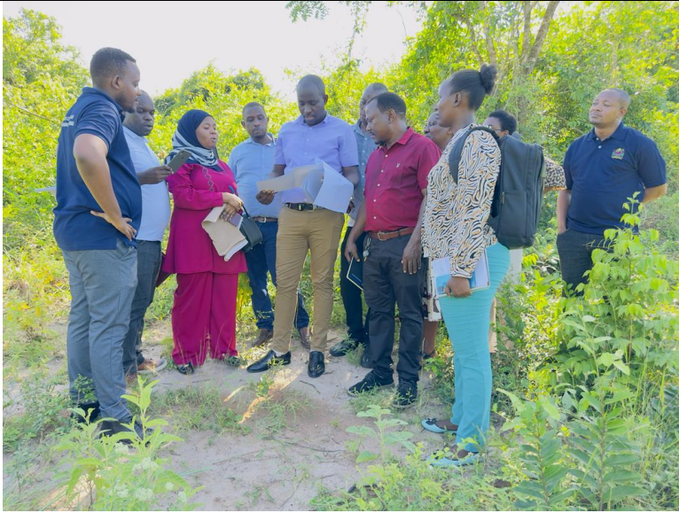
NPIU( QS & Engineer) and the consultant conducted a site visit to the location where an academic block will be constructed within Changanyikeni Campus