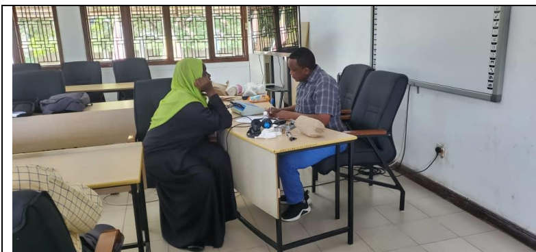
Hearing impairment testing to EASTC Students under HEET project