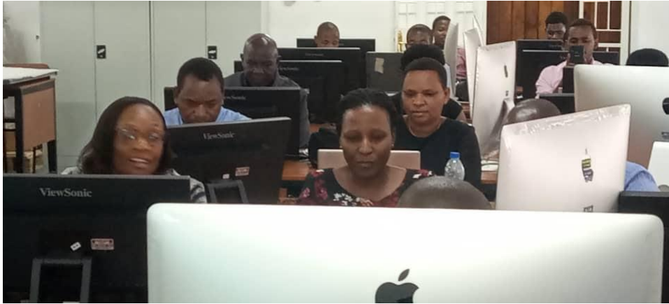
EASTC MOODLE Training to academic Staff