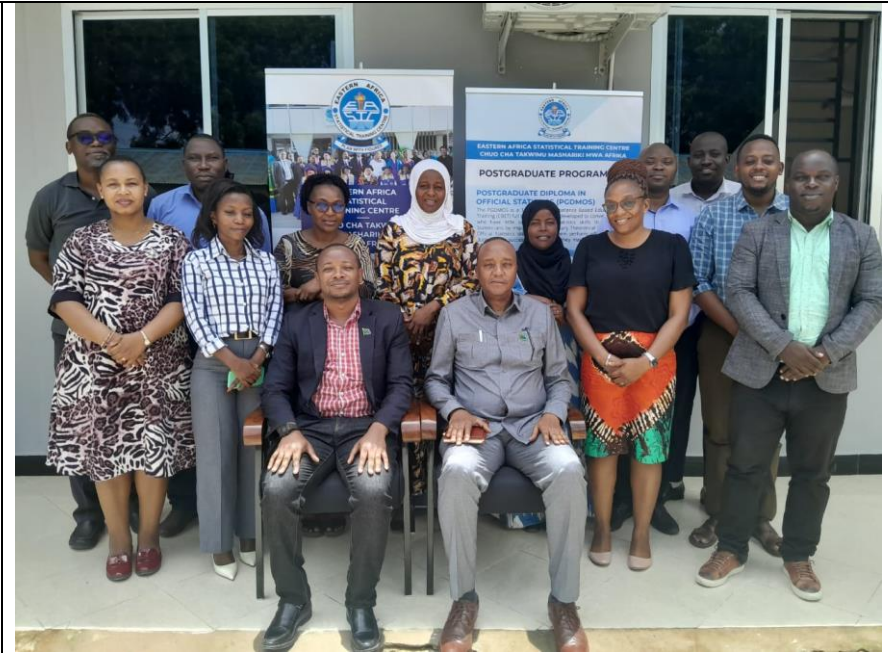
External Stakeholders engagement to review and comment of Consultant Documents