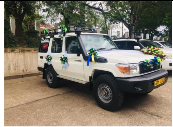
Field motor vehicle supported by HEET Project