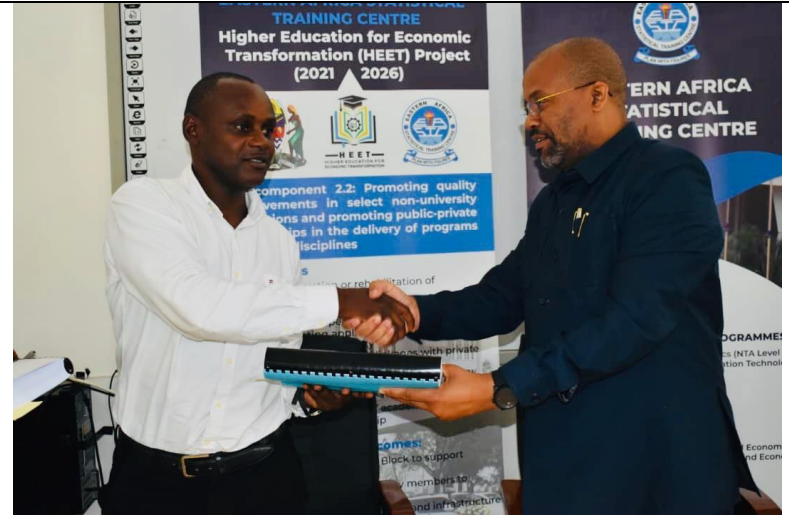
Training on Contract Management for EASTC HEET Project IPIU