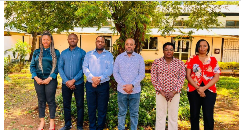
EASTC PRO team during preparation of the HEET Communication Strategy