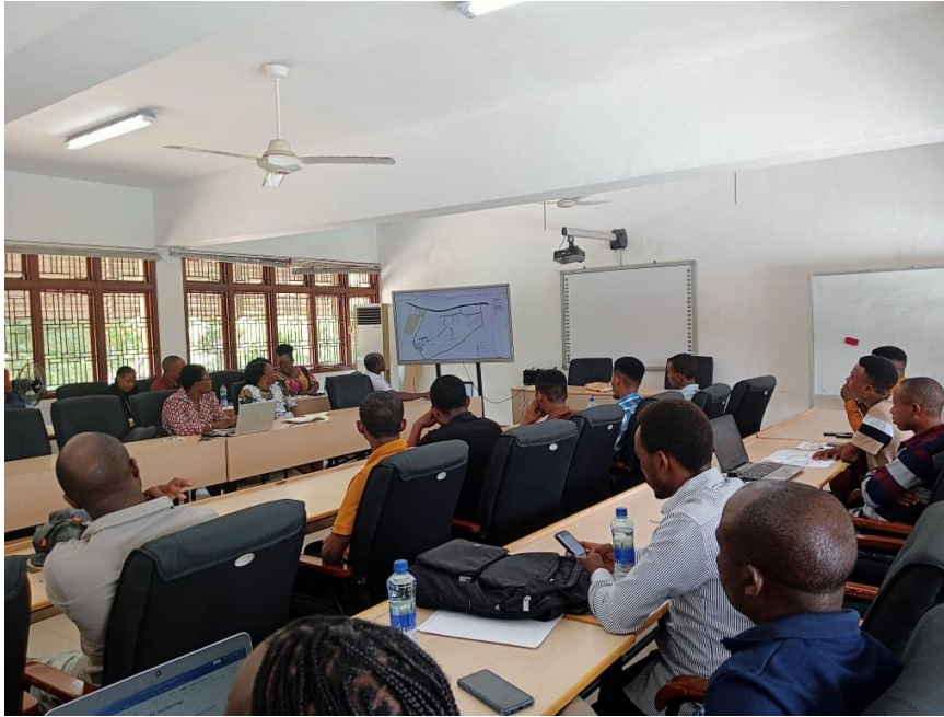
Internal Stakeholders engagement to review and comment of Consultant Documents