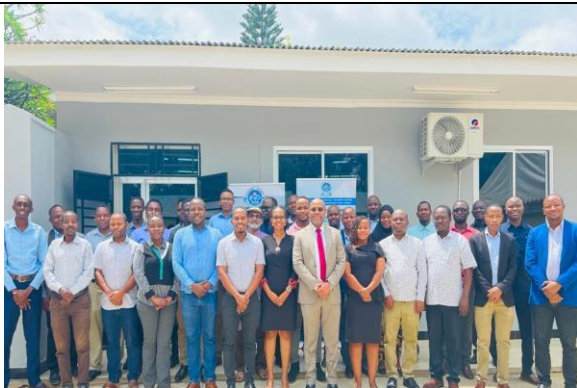
Stakeholders workshop for Curriculum Review and Development