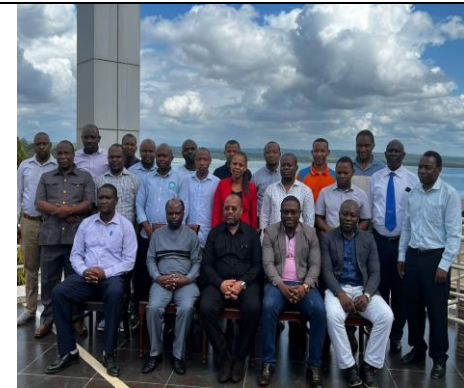
Occupational analysis workshop for Curriculum Review and Development