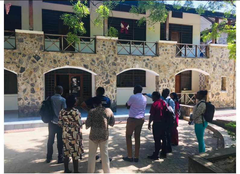
NPIU and the consultant conducted a site visit to Hostels to be rehabilitated under HEET project within Changanyikeni Campus