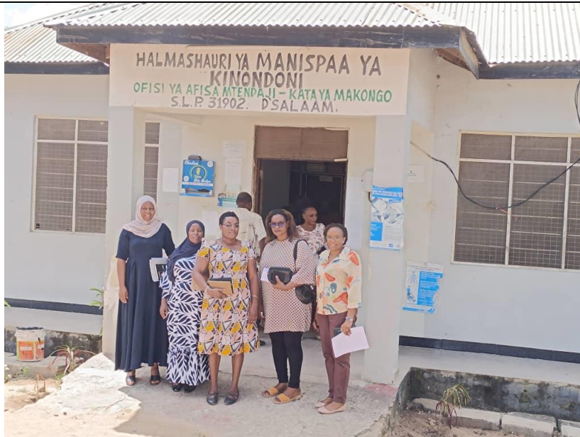
Environmental & Social Safeguards Stakeholders Engagement-