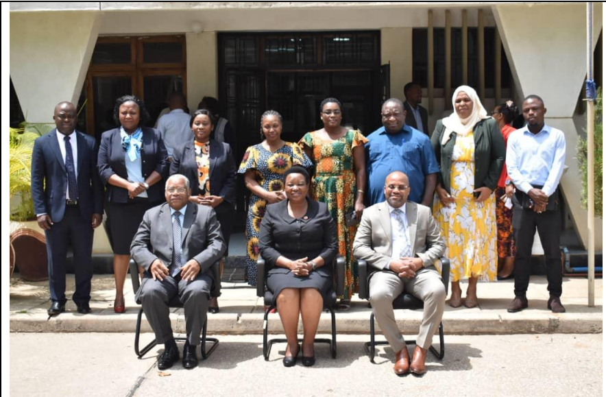
Chairperson of the EASTC MAB with PS during the launch of EASTC-IAC