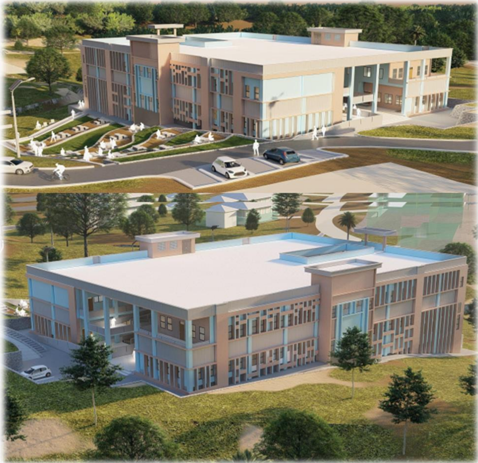
Academic Block to be Constructed under HEET project