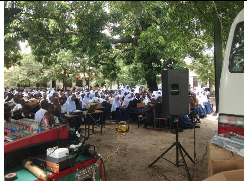
Outreach programs were conducted in six schools across Dar-es-Salaam and Pwani, reaching 4,551 female students, to raise awareness about university STEM programs and dispel misconceptions about women's capabilities in these fields.