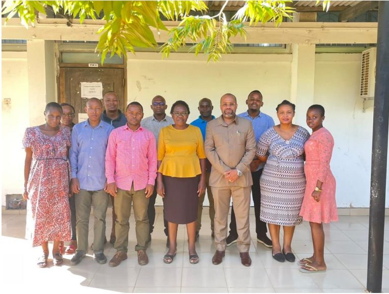
EASTC IPIU workshop on HEET project implementation