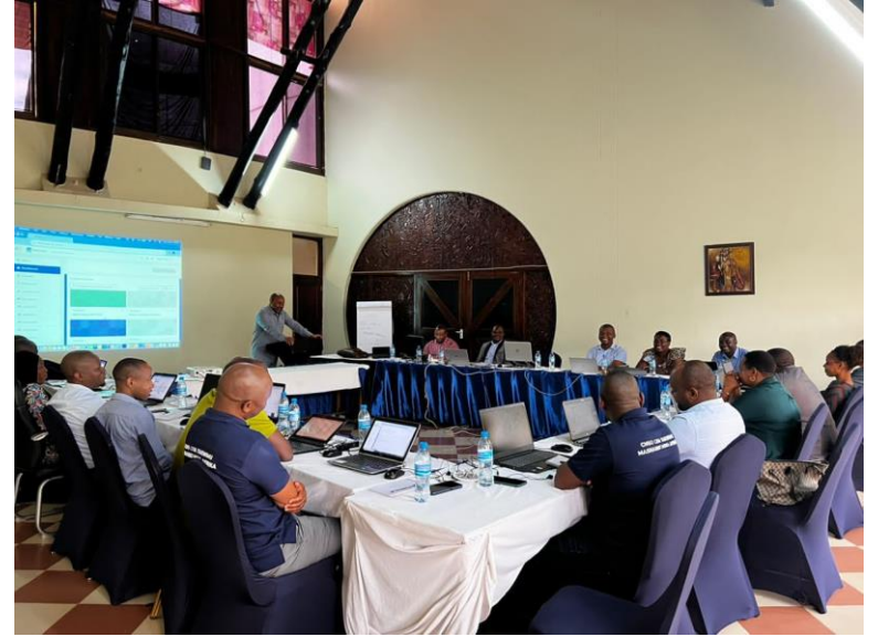
Workshop to upload MOODLE Resources to support learning